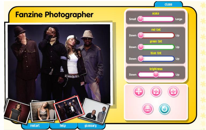
Girls manipulate celebrity photos

Computer Clubs for Girls is an award-winning initiative from e-skills UK, supported by DfES. Its aim is to help transform the attitudes of a generation of girls, and get them interested in technology in ways that are relevant to them – one example is by giving girls an insight into the magazine publishing industry.