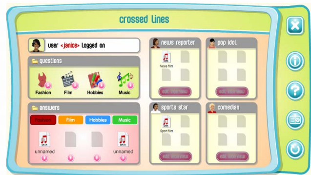
Girls learn interviewing techniques