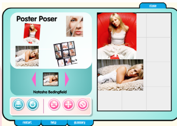
Girls design a celebrity poster